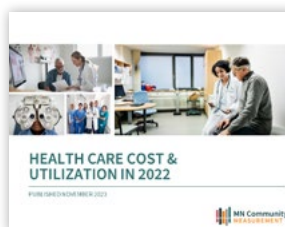
Health Care Cost and Utilization