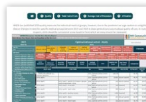
MNCM's Dynamic Tables benchmarking tool (available to members only)