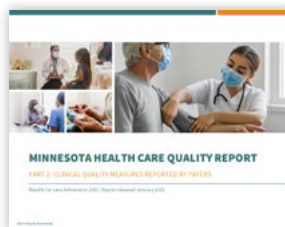
Health Care Quality Report Part 2