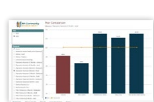
Medical group benchmarking reports (available to members only)