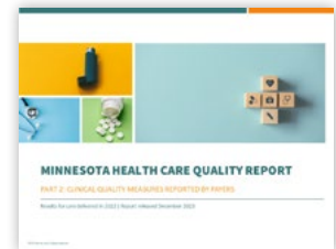
Health Care Quality Report Part 2