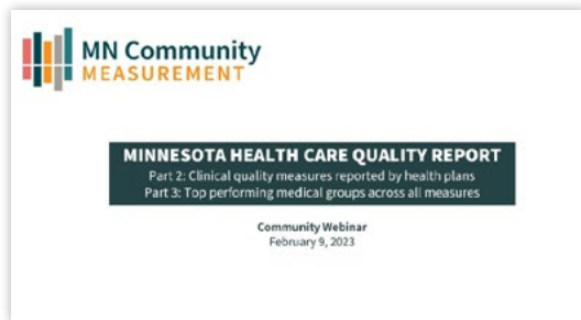
Health Care Quality Report, Parts 2 and 3 February 9 SLIDES // RECORDING

In addition, MNCM presented seven public webinars in 2023.