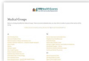
At-a-glance medical group and clinic profiles available through the MNHealthScores page