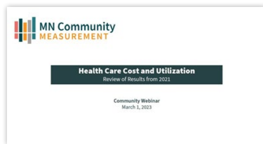
Cost and Utilization Report March 1 SLIDES // RECORDING