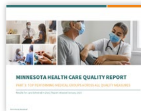
Health Care Quality Report Part 3