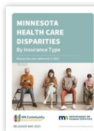
Health Care Disparities by Insurance Type