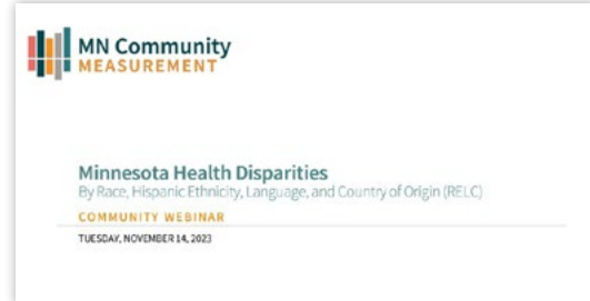
Health Care Disparities by Race, Ethnicity, Language, and Country of Origin November 14 SLIDES // RECORDING