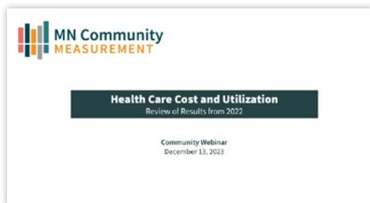
Cost and Utilization Report December 13 SLIDES // RECORDING