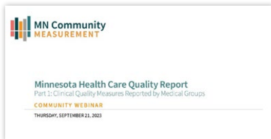
Health Care Quality Report, Part 1 September 21 SLIDES // RECORDING