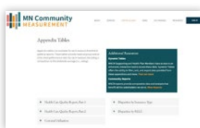
Detailed appendices to public reports

In addition to summary reports showing statewide trends and variation, MNCM makes its medical group and clinic level data about the quality and cost measures included on its slate of measures for public reporting available in a variety of ways. These include: