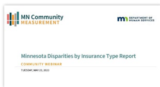
Health Care Disparities by Insurance Type Report May 23 SLIDES // RECORDING