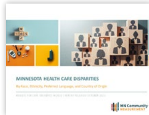
Health Care Disparities by Race, Ethnicity, Language, and Country of Origin