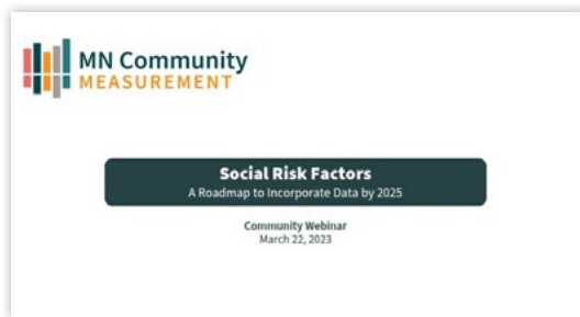
Social Risk Factors Data Collection Roadmap March 22 SLIDES // RECORDING