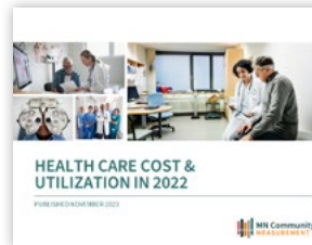
Health Care Cost and Utilization